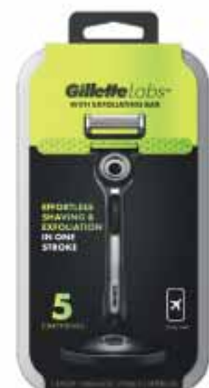
A CLOSE SHAVE

"Gillette's SkinGuard range is just amazing, as is the shaving cream that goes with it."