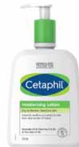
FRAGRANCE-FREE BODY CREAM

TRY: L'Oréal Paris Plump & Set Brow Artist Transparent Serum